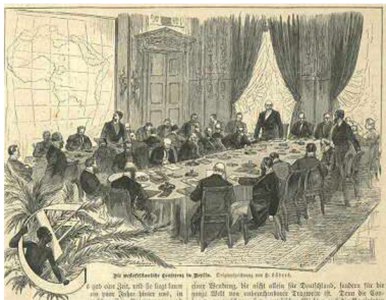
The Berlin Conference by Gartenlaube, 1884.

The conference of Berlin in 1884-85 set the rules for the partition of the whole of Africa. Strangely, it recognised the Congo Free State as the personal possession of Leopold II, the king of Belgium. Leopold II had been one of the instigators of the formal European land and power grab, and was personally rewarded for this role; the result would be the creation of one of the most inhumane of all the European colonial systems established in Africa.