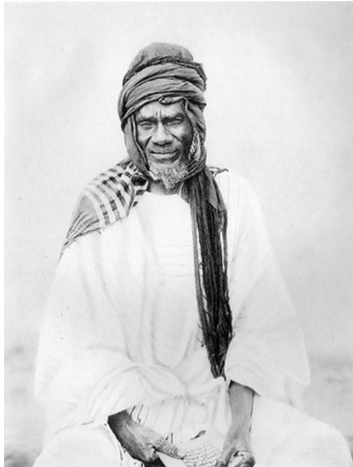
Samori Ture (c. 1830 – June 2, 1900).

Other tools also facilitated the European invasion at the end of the nineteenth century. The steamboat and the telegraph accelerated the pace of the colonial conquest as faster travel and communication meant that European armies could easily distribute troops in different corners of Africa for short periods. Tropical diseases were brought under control by scientific discoveries. Before 1860, Europeans in West Africa were 75% likely to die within 2 years, but the treatment of malaria with quinine saw the risk fall to 8% by 1900.